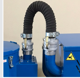
Suction and Discharge Air Hose