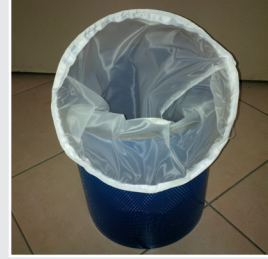
Basket and Bag Filter