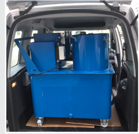
Easy to Carry