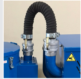
Suction and Discharge Air Hose